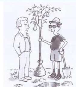
“It was my sponsor’s idea. He suggested I grow a pear.”

* For more information visit our website at SunriseSunsetGroup.org